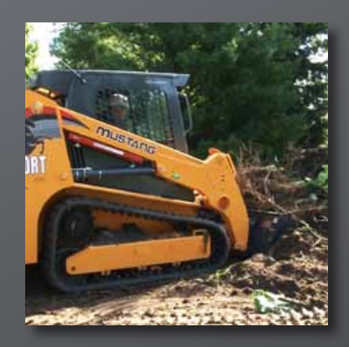
HORSEPOWER MANAGEMENT SYSTEM A monitors and adjusts the hydrostatic drive pump, resulting in tractive effort of 11,840 lbs. (5371 kg) on the 1750RT NXT2, 12,359 lbs. (5606 kg) on the 2100RT NXT2, and 14,317 lbs. (6494 kg) on the 2500RT.