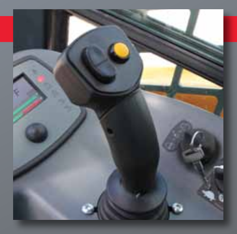
DRIVE SENSITIVITY ADJUSTMENT offers five settings that adjust five operational characteristics to suit operator preference and application requirements.