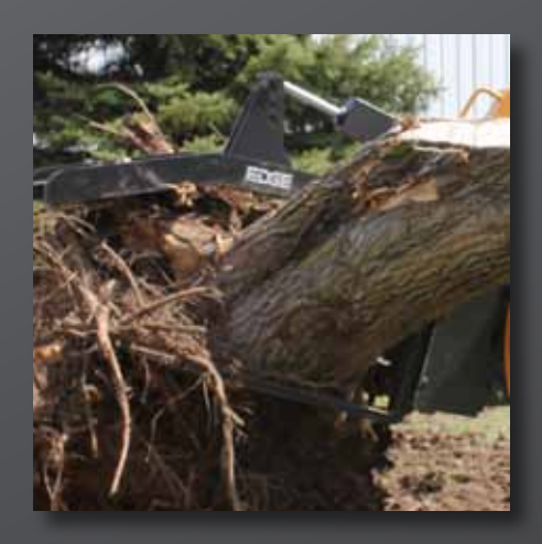
HYDRAULIC SYSTEM with flow up to 37.4 gpm (141.6 L/min.) on the 2500RT delivers high performance and fast cycle times. Lift cylinders incorporate cushioning for smoother operation when lowering the lift arm.