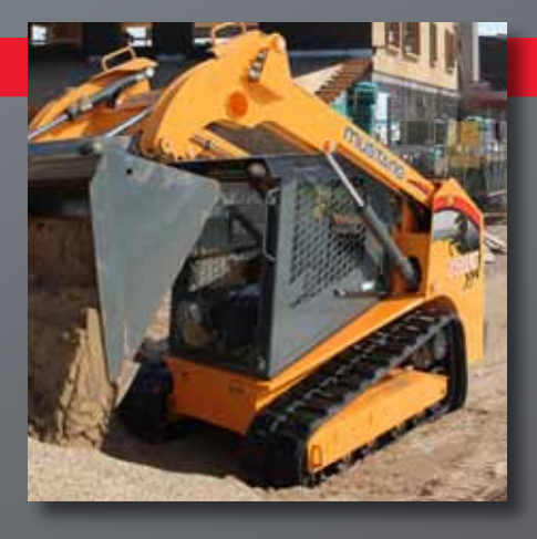
DEDICATED , WELDED TRACK LOADER CHASSIS a aids in superior weight distribution, which enhances stability, grading, tractive effort and ride control.