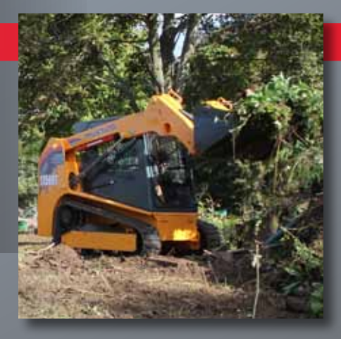
OPTIMIZED RADIAL BOOM DESIGN ▲ offers increased strength and up to 128" (3251 mm) of lift height – higher than any competitor in their respective weight classes.