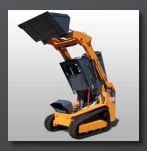
SERVICEABILITY A All-new cab support lock eliminates the need for a second person when raising the ROPS/FOPS structure for maintenance.